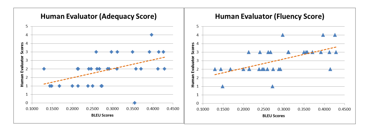
Fig. 3. BLEU vs. Human Evaluator